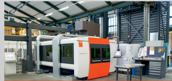
Fibre laser, fully automated sheet metal warehouse