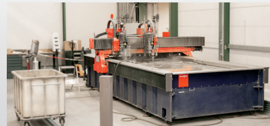
Water Jet Cutting