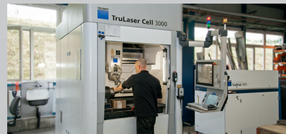
2D/3D Laser Cutting and Welding